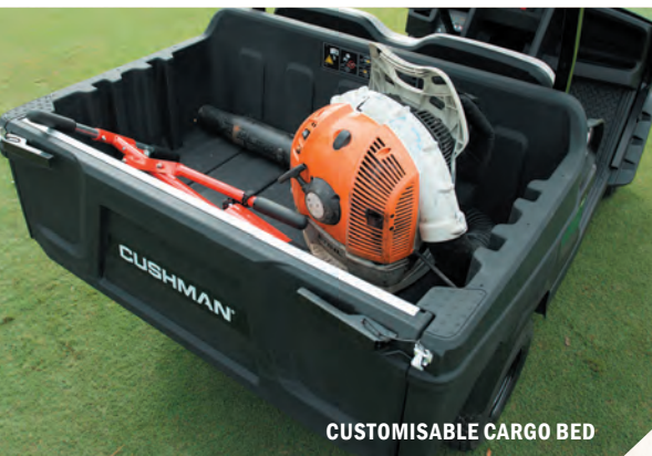
CUSTOMISABLE CARGO BED