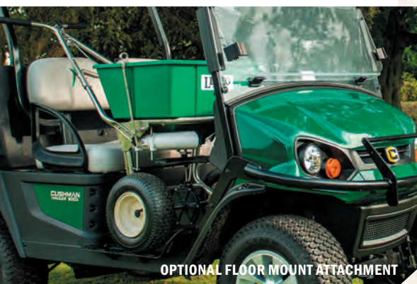
OPTIONAL FLOOR MOUNT ATTACHMENT